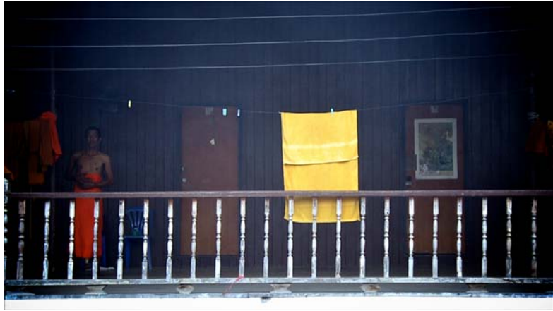
Taiki Sakpisit Looking into God's Eye Video Dimension variable 2010