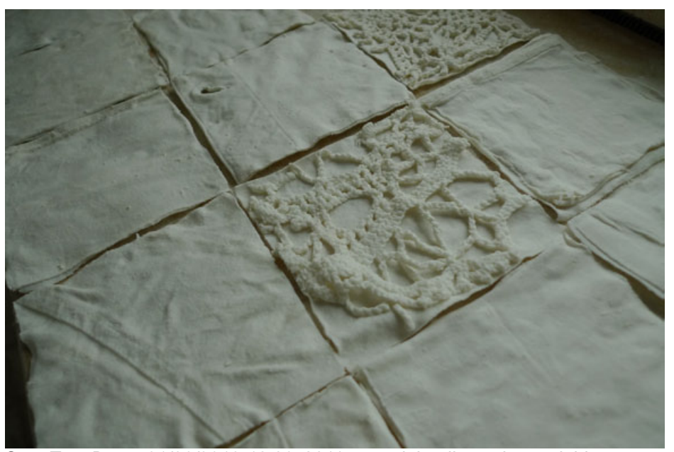
Sara Tse, Dress 01/06/2010-18:30, 2011, porcelain, dimension variable